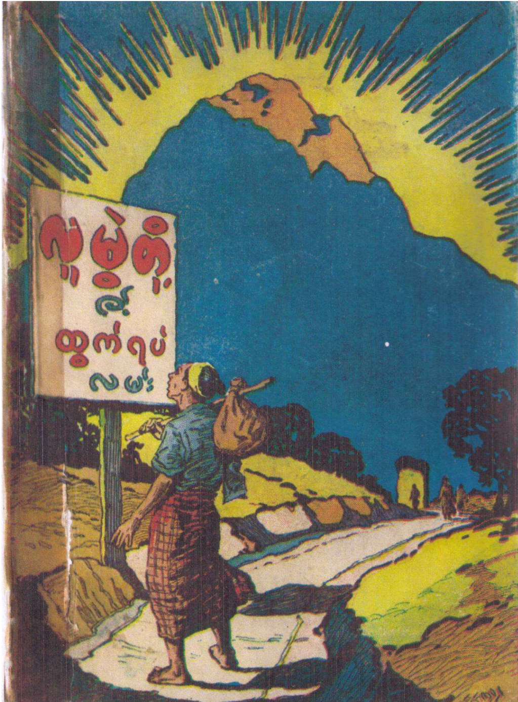
Reproduction of Title Page

(The signboard carries the title of the book: "Way out of poverty")