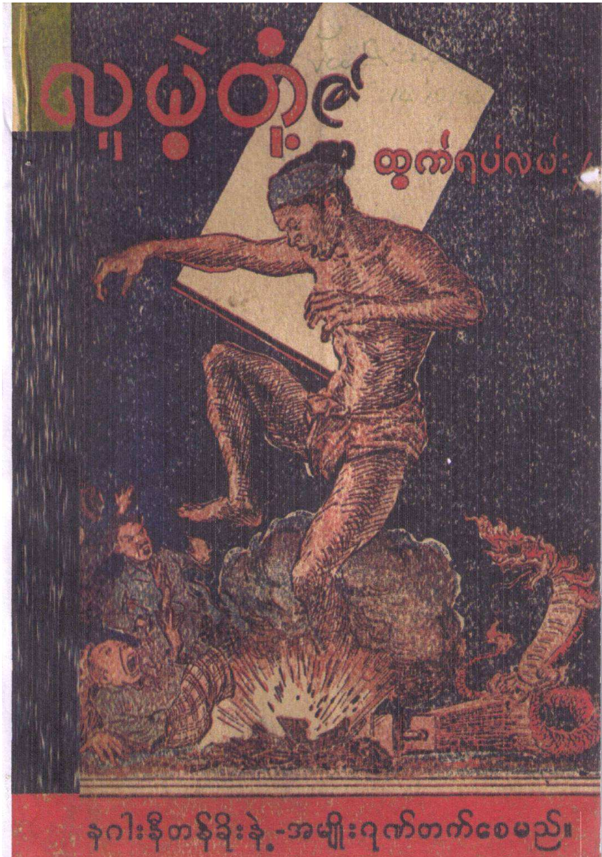
Reproduction of Title Page