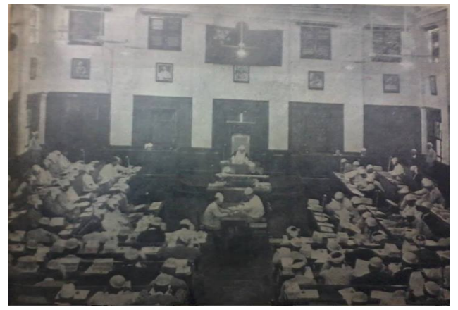
The Chamber in session

The main qualification of the first generation of people to be elected to the Constituent Assembly was their reliability with regard to fighting for independence in case of a failure of the constitutional process, Maung Maung writes. Most of the elected were in their twenties what made Aung San, born 1915, senior to many of them. After the fight for independence was won and the assembly